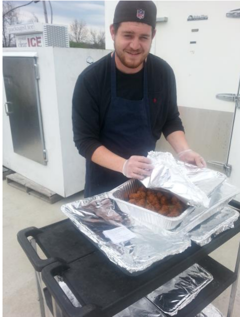
High Point Catering donates food left from a Manna fundraising event.

You can make a real difference in Montgomery County when hiring a caterer for your events. Community Food Rescue (CFR) provides an easy way to share unused catered food with people who are food insecure—including approximately 63,000 residents in Montgomery County. Donating surplus food also prevents good food from going to waste.