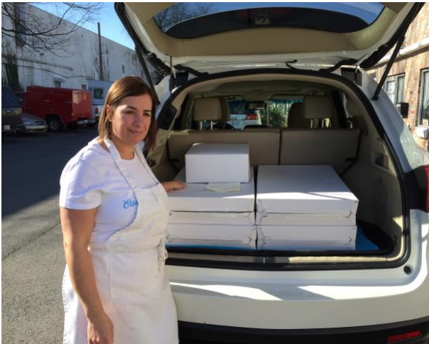
Custom Cake Design donates surplus cake to Rainbow Community Development Center.